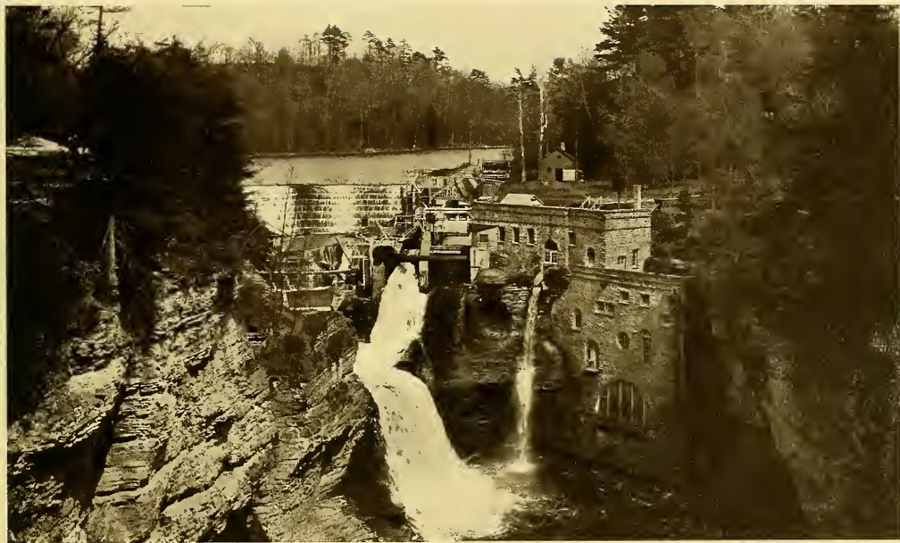
THE HYDRAULIC LABORATORY